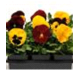
Autumn Blaze Mixture