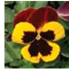
Red Wing Improved