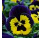
Yellow Purple Wing