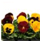
Autumn Blaze Mixture