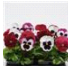
Raspberry Sundae Mixture