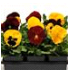
Autumn Blaze Mixture