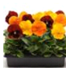
Topaz and Garnet Mixture