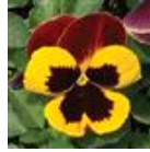
Red Wing Improved