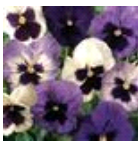
Ocean Breeze Mixture