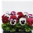
Raspberry Sundae Mixture