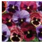
Coastal Sunrise Mixture