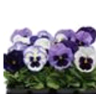
Ocean Breeze Mixture