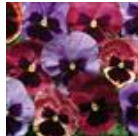
Coastal Sunrise Mixture