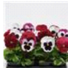
Raspberry Sundae Mixture