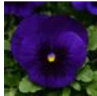
Deep Blue Blotch