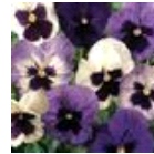
Ocean Breeze Mixture