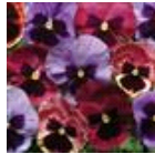
Coastal Sunrise Mixture