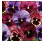
Coastal Sunrise Mixture