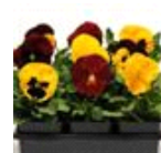
Autumn Blaze Mixture