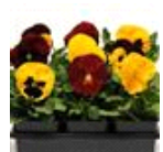
Autumn Blaze Mixture