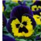
Yellow Purple Wing