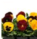
Autumn Blaze Mixture