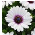
White Purple Eye