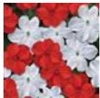
Red White Mixture