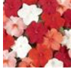
Cha Cha Mixture