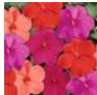
Voodoo Too Mixture