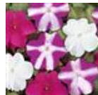
Violet Star Blend