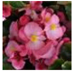
Pink Green Leaf