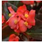
Red Bronze Leaf Improved