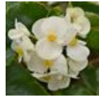
White Green Leaf