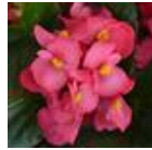
Rose Green Leaf