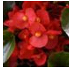
Red Green Leaf