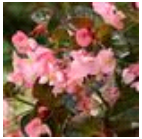
Pink Bronze Leaf