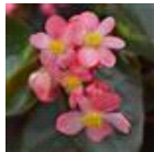
Pink Bronze Leaf