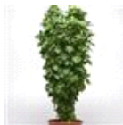
Everleaf Thai Towers