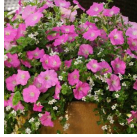
Silk N' Satin