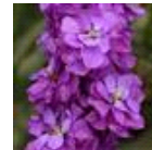
Miracle Blue Mid