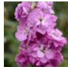
Ball Pink No 22