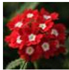
Red with Eye