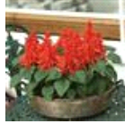
Red Hot Sally II