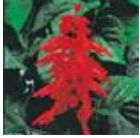
Red Hot Sally II