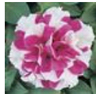
Rose And White