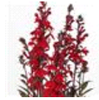
Scarlet Bronze Leaf