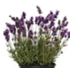
Avignon Early Blue