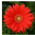
Red with Light Eye