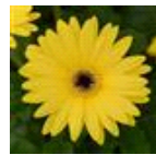
Yellow with Dark Eye