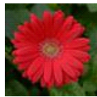
Deep Rose with Light Eye