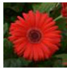
Red with Dark Eye