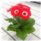
Bicolor Red White