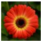
Bicolor Orange Yellow