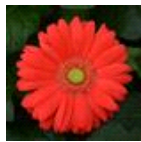
Cherry with Light Eye