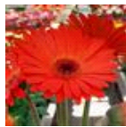
Deep Orange with Dark Eye