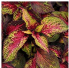
Rose to Lime Magic