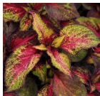
Rose to Lime Magic