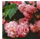
White Pink Picotee