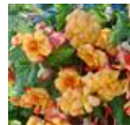
Yellow Red Picotee