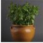
Sweet Dani Lemon