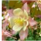
Pink And Yellow