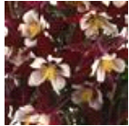
Burgundy And White