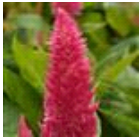
Bright Pink Improved