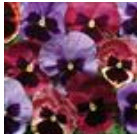
Coastal Sunrise Mixture