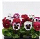
Raspberry Sundae Mixture