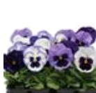
Ocean Breeze Mixture