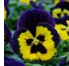
Yellow Purple Wing