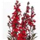
Scarlet Bronze Leaf