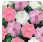
Baby Shower Mixture