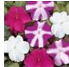
Violet Star Blend