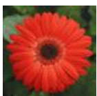
Red with Dark Eye