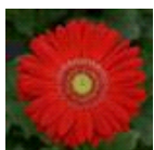
Red with Light Eye