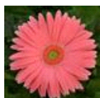
Salmon Shades with Light Eye