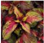
Rose to Lime Magic