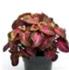
Rose to Lime Magic