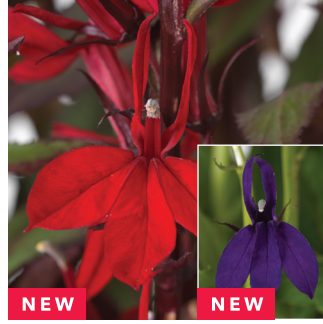
Starship Scarlet Bronze Leaf Lobelia

Shows off vibrant true blue flowers with light purple accents and white bees. The grower-friendly, uniform plants are more compact, more responsive to PGRs and naturally earlier than other D. elatum types.