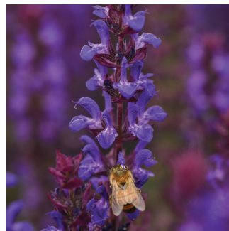
Salvatore Blue Salvia

This tight, well-branched and strong-stemmed plant shows deeper blue blooms earlier than similar English Lavenders. Grown as annual in the early cool season, Avignon Early Blue finishes about 2 weeks earlier than our Ellagance Purple and 1 week before the competition. Critical daylength is only 10 hours, like Ellagance Purple, but Avignon Early Blue grows better in cool conditions.