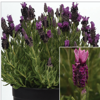
Bandera Deep Purple Lavender

Featuring the largest spikes and the deepest blue-colored calyx, spikes and flowers in Salvia nemorosa from seed, this perennial has a premium-look and offers the possibility to finish in gallons by early Spring! Great for Fall, too!