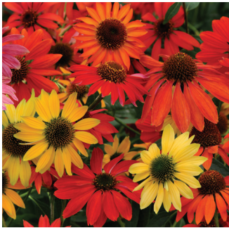
'Cheyenne Spirit' Echinacea

Earlier flowering; improved branching; low stretch; uniform, controlled habit; and huge flower power assure a better-quality finished plant than the competition.