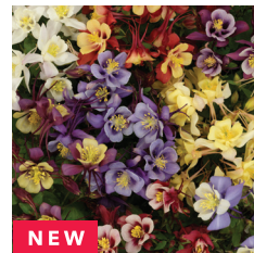
Earlybird Red Yellow Aquilegia