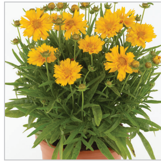
Double the Sun Coreopsis