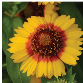
Mesa Bright Bicolor Gaillardia

Beautiful, lacy, slightly scented flowers top these knee-high plants and will keep the perennial borders rocking for years to come, thanks to their durable performance and count-on-it overwintering!