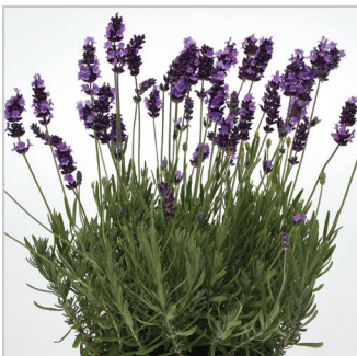
Avignon Early Blue Lavender

This compact, semi-double yellow Coreopsis finishes 2 to 3 weeks earlier than Early Sunrise and other comparable varieties in the early cool season, and 1 to 2 weeks earlier in Summer.