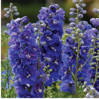
Dasante Blue Delphinium