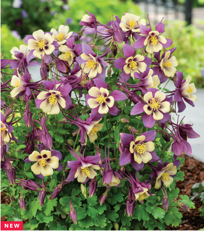
Earlybird Purple Yellow Aquilegia

The first F1 hybrid seed Echinacea elevates the class to offer consistency of plant structure for uniform and highly branched, full plants. Features uniform flowering, so all plants are ready to sell at the same time. NEW Amplified seed form offers fast and uniform germination.