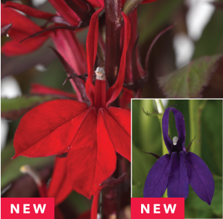
Starship Blue Starship Scarlet Bronze Leaf Lobelia Lobelia .