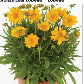
Double the Sun Coreopsis