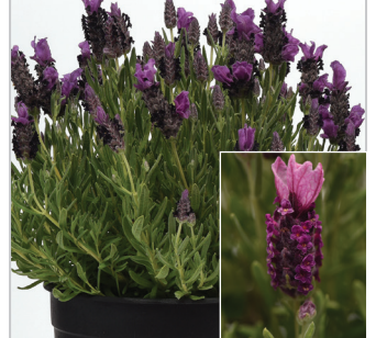
Bandera Deep Purple Lavender

This sturdy perennial offers a larger percentage of saleable plants compared to standard seed varieties, with each plant building a new layer of stunning clear-white flowers on top of the older ones.