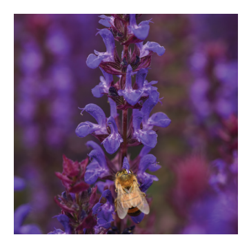
Salvatore Blue Salvia

This tight, well-branched and strongstemmed plant shows deeper blue blooms earlier than similar English Lavenders. Grown as annual in the early cool season, Avignon Early Blue finishes about 2 weeks earlier than our Ellagance Purple and 1 week before the competition. Critical daylength is only 10 hours, like Ellagance Purple, but Avignon Early Blue grows better in cool conditions.