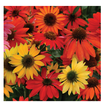
Cheyenne Spirit' Echinacea

This compact, semi-double yellow Coreopsis finishes 2 to 3 weeks earlier than Early Sunrise and other comparable varieties in the early cool season, and 1 to 2 weeks earlier in Summer.