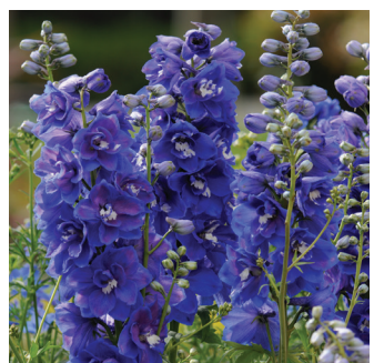
ante Blue Delphinium