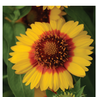
Mesa Bright Bicolor Gaillardia

Beautiful, lacy, slightly scented flowers top these knee-high plants and will keep the perennial borders rocking for years to come, thanks to their durable performance and count-on-it overwintering!