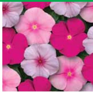
Bubble Gum Mixture