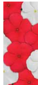
Red And White Mixture