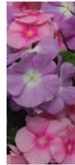
Cotton Candy Mixture