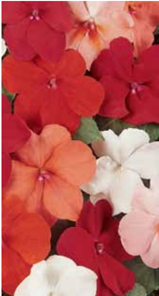
Super Elfin® Standard

Must-have colors to round out the widest impatiens offering