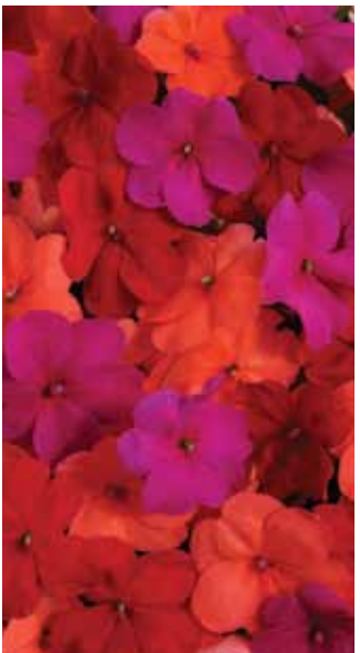
South Beach Mixture