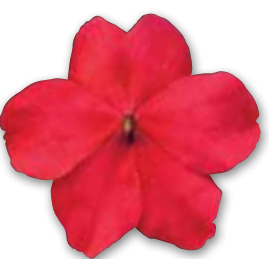
New Punch 'PAS933564'