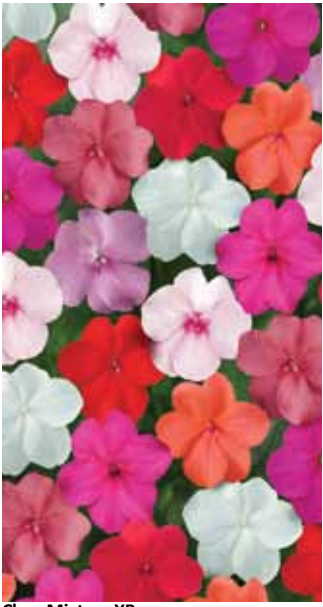
Clear Mixture XP