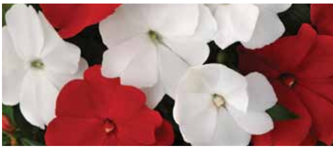
Red White Mixture