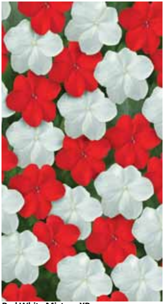
Red White Mixture XP