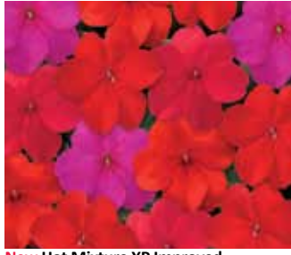
New Hot Mixture XP Improved