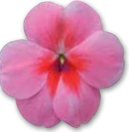
Pink Splash 'PAS774966'