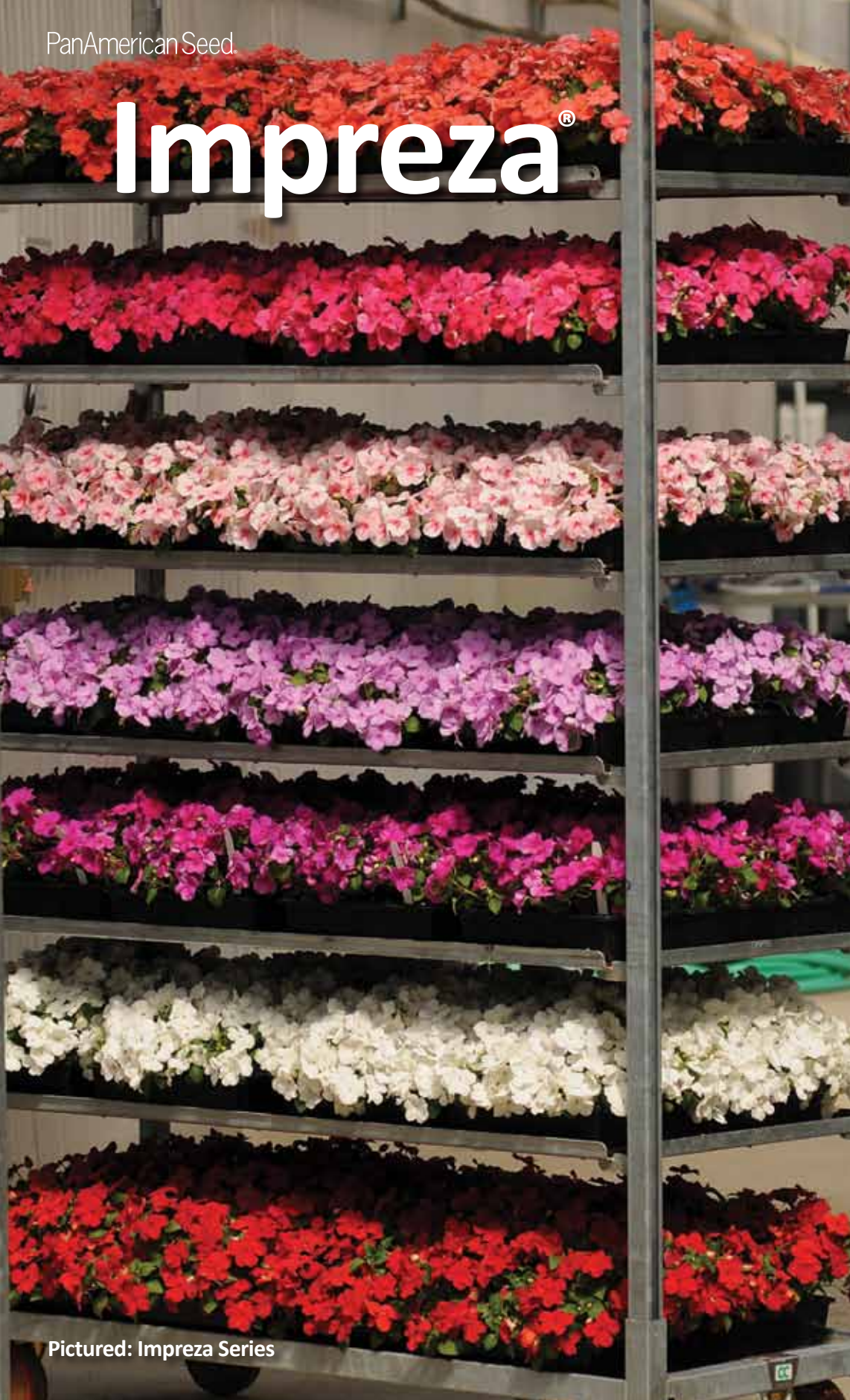
Pictured: Impreza Series

Impreza provides better holdability and the longest shelf life of any impatiens, maximizing sales and minimizing waste.