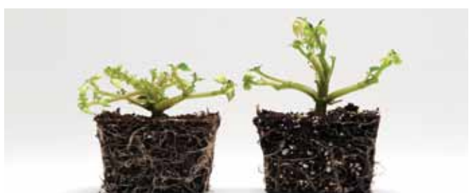
The plant "skeleton" of Impreza plants (left) results in better holdability than the competition (right).