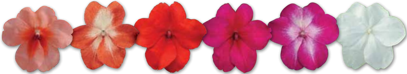
Salmon Splash XP 'PAS842482' Salmon Starburst XP U.S. Utility Patent Number 5,986,188, 'PAS409672' New Scarlet XP Improved 'PAS933547' Violet XP 'PAS751935' Violet Starburst XP U.S. Utility Patent Number 5,986,188, 'PAS751936' White XP 'PAS91731'