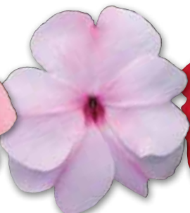
New Pink Pearl