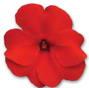
Orange Bronze Leaf