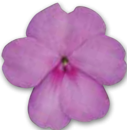
Blue Pearl 'PAS774961'