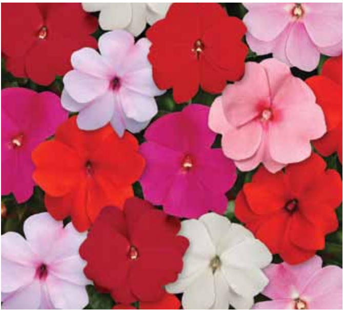
New Mixture Improved