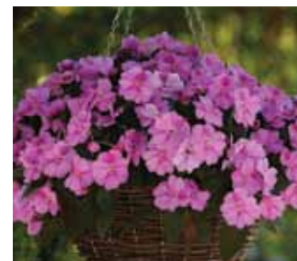
Excellent in baskets; Lavender shown here.