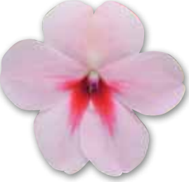
Cherry Splash 'PAS774965'