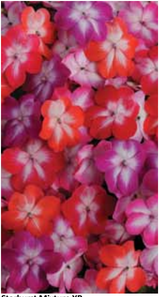
Starburst Mixture XP