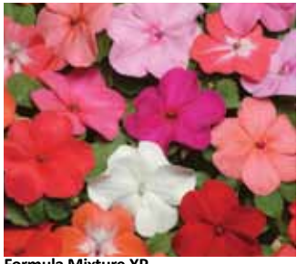
Formula Mixture XP