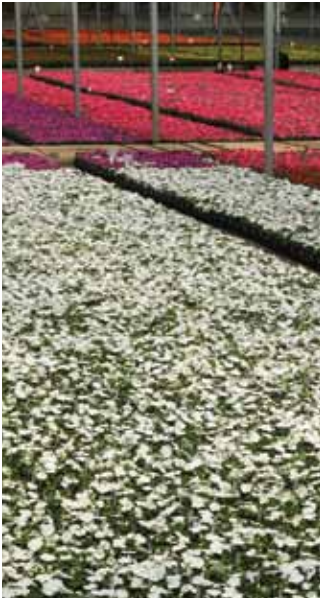
Super Elfin® XP