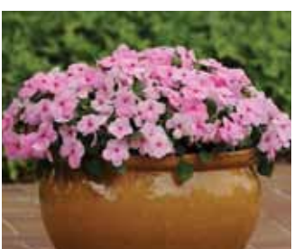
All colors look great all season; Pink shown.