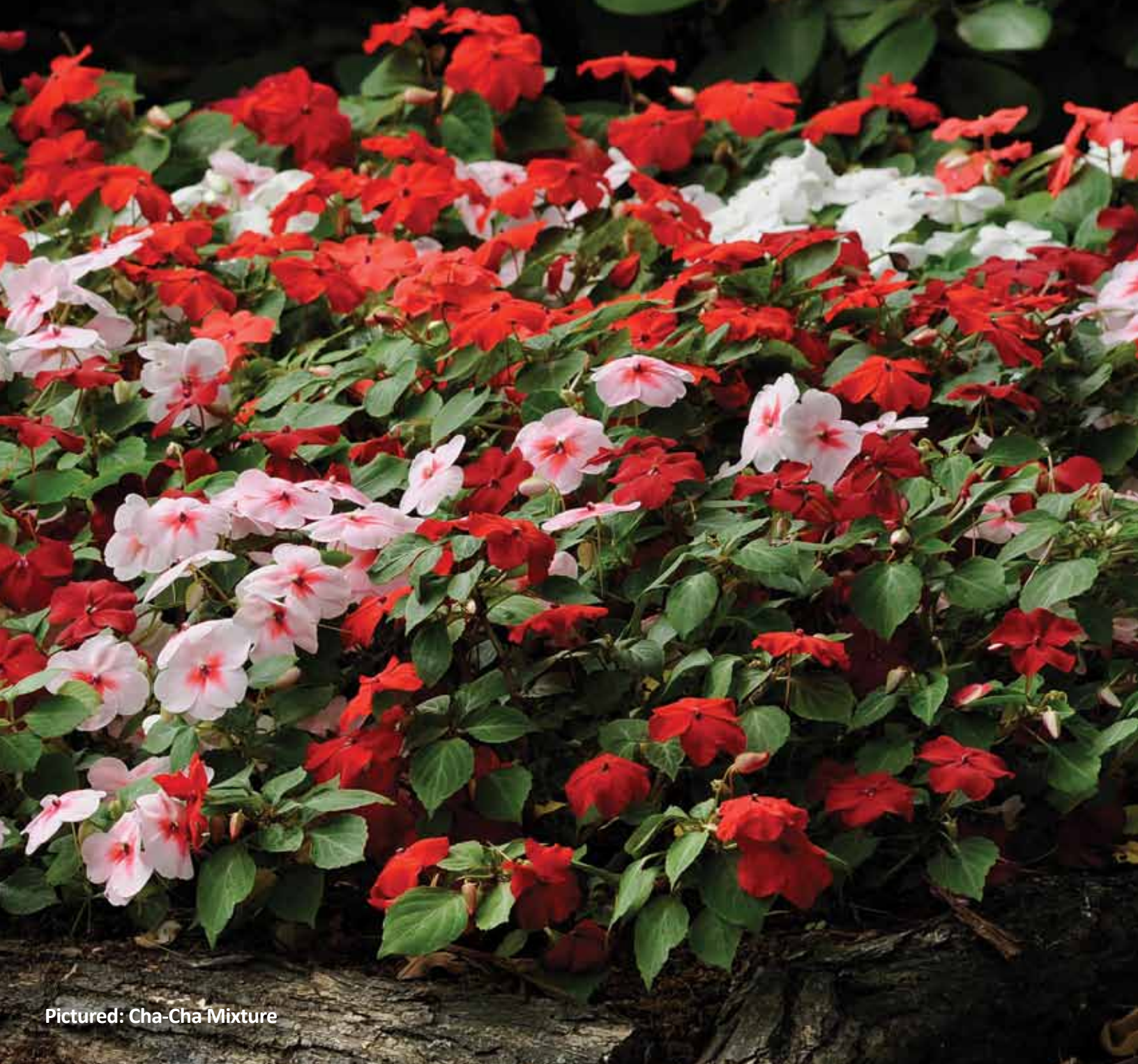
Pictured: Cha-Cha Mixture