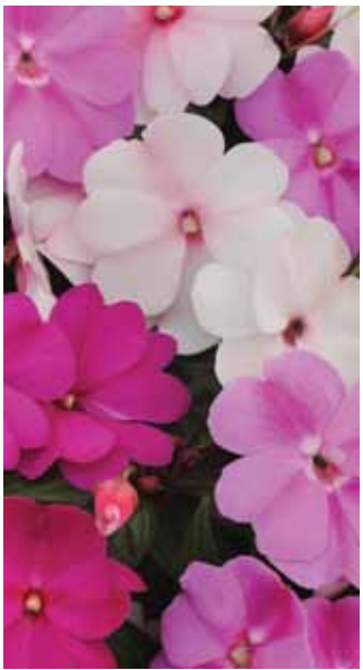
New Mystic Mixture Improved