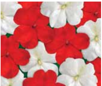
Red White Mixture