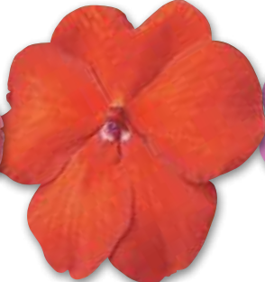
Bright Orange 'PAS2364'