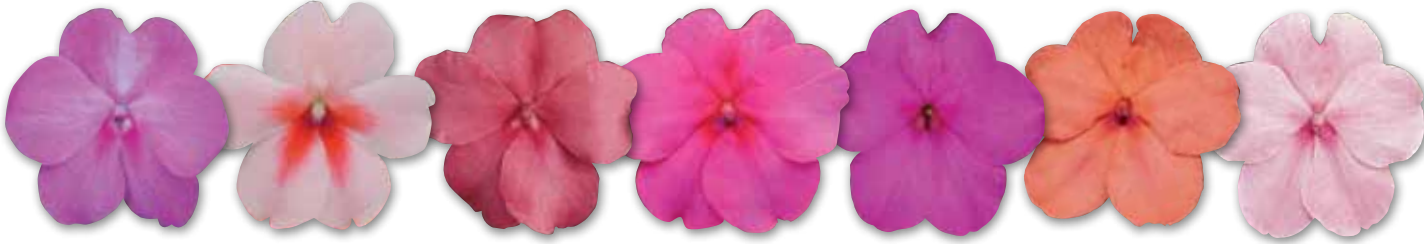
Blue Pearl XP 'PAS97382' Cherry Splash XP 'PAS746357' Coral XP 'PAS320590' New Deep Pink XP Improved 'PAS907015' Lilac XP 'PAS746358' Melon XP 'PAS320590' Pink XP 'PAS320591'