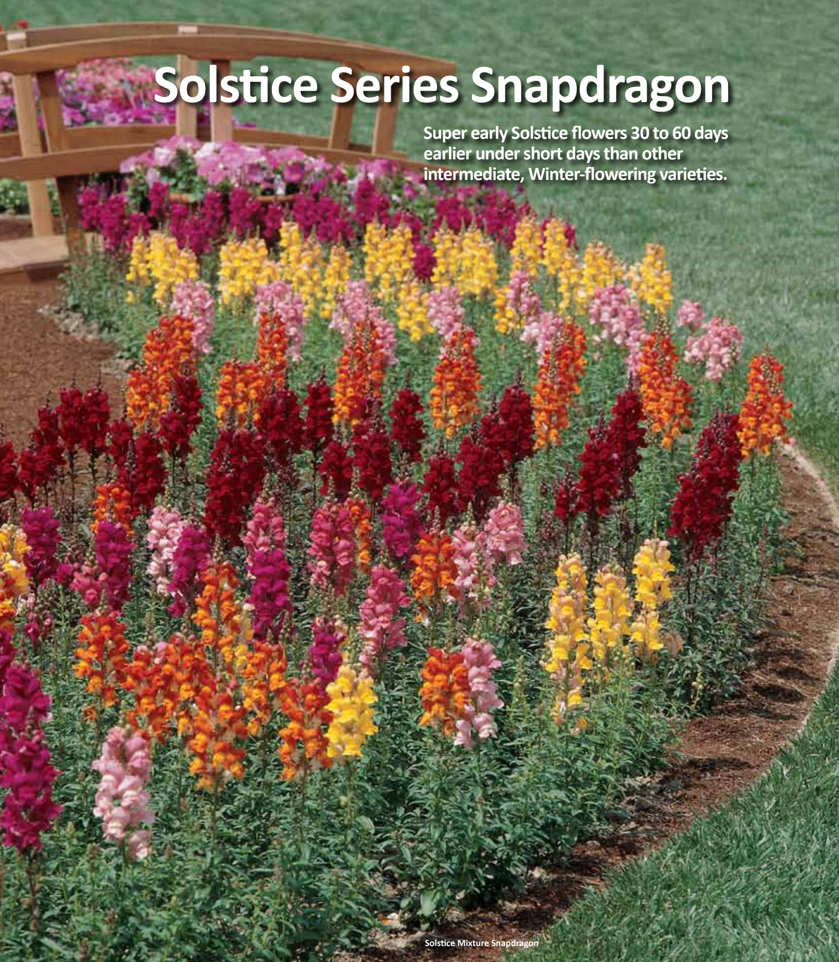
Solstice Mixture Snapdragon

Super early Solstice flowers 30 to 60 days earlier under short days than other intermediate, Winter-flowering varieties.