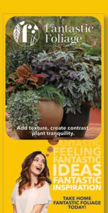
Poster 19"x38" (48x97 cm)