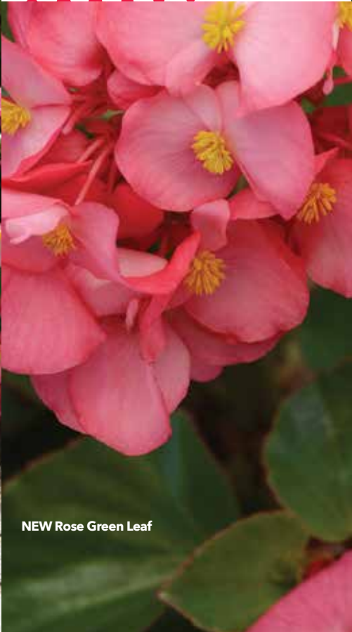
NEW Rose Green Leaf