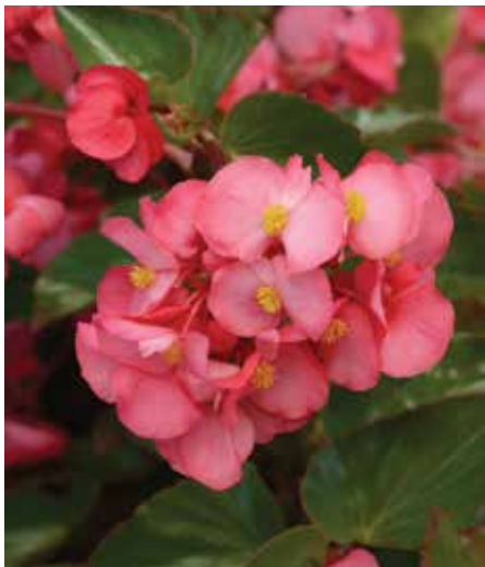
NEW Rose Green Leaf