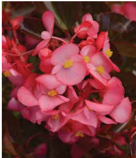
NEW Rose Bronze Leaf

All-new Megawatt opens the door to MEGAselling opportunities: Unique Pink Bronze Leaf and partner Rose Bronze Leaf go to market faster to grab Spring sales. Megawatt Green Leaf varieties pump out extra vigor for bigger flower explosion.