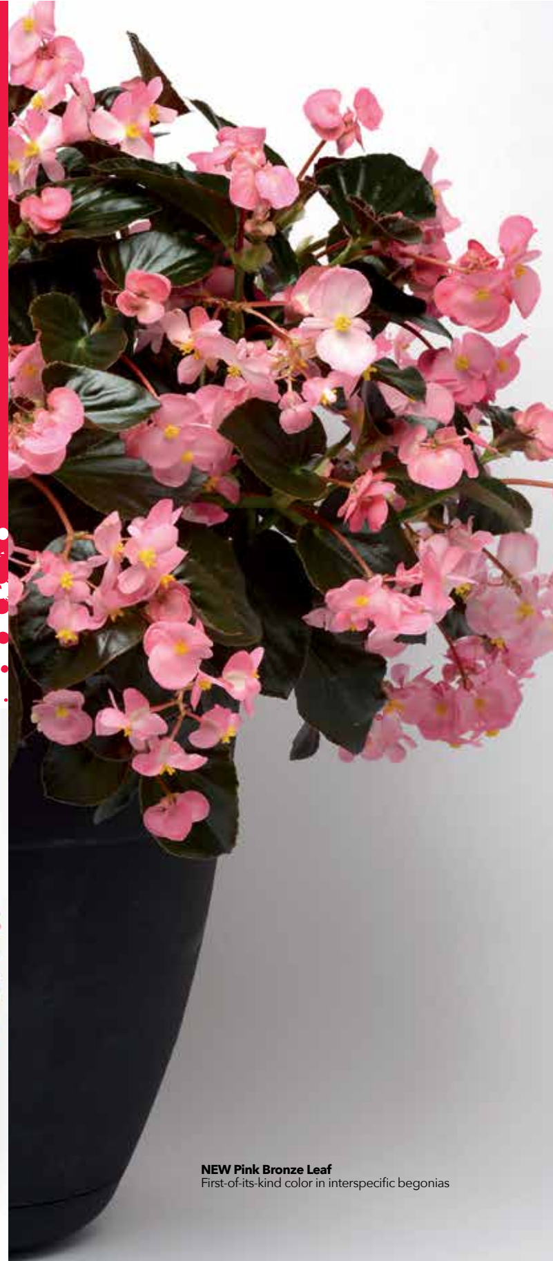
NEW Pink Bronze Leaf First-of-its-kind color in interspecific begonias