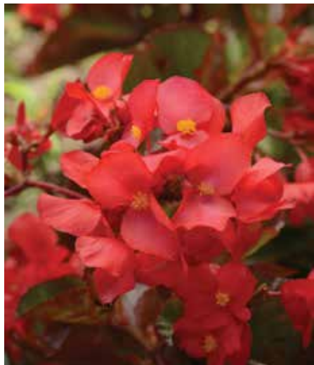
NEW Red Green Leaf