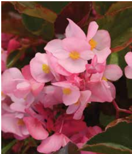
NEW Pink Bronze Leaf First-of-its-kind color in interspecific begonias