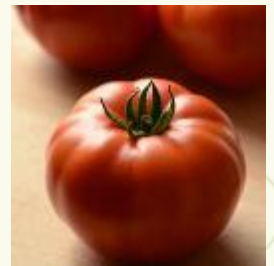
Genuwine (red slicer) Maturity: 70-75 days Indeterminate

Talk to your preferred supplier for seed, plugs and plants of every HandPicked Vegetable variety. Variety info, growing tips, downloadable Display Cards and more at panamseed.com/HandPicked . 630 231-1400 or 800 231-7065 | panamseed.com/HandPicked