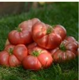
Big Brandy (pink beefsteak) Maturity: 75-80 days Indeterminate