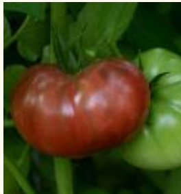
Cherokee Carbon (purple beefsteak) Maturity: 75-80 days Indeterminate