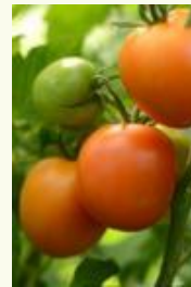
Perfect Flame (orange saladette) Maturity: 65-70 days Indeterminate