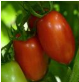
Marzinera (red roma/paste) Maturity: 70-75 days Indeterminate