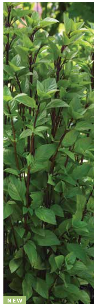
'Everleaf Thai Towers'