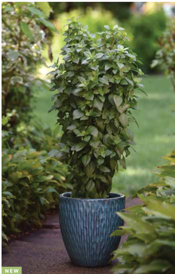
'Everleaf Thai Towers'