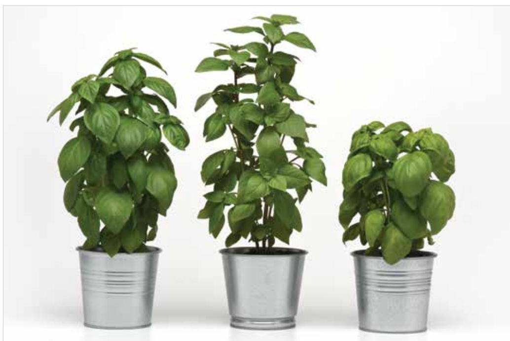
Everleaf Basil Collection L-R: Everleaf Emerald Towers, NEW 'Everleaf Thai Towers' and Everleaf Genovese