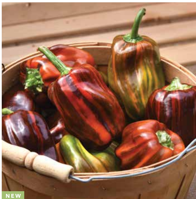
NEW Candy Cane Chocolate Cherry