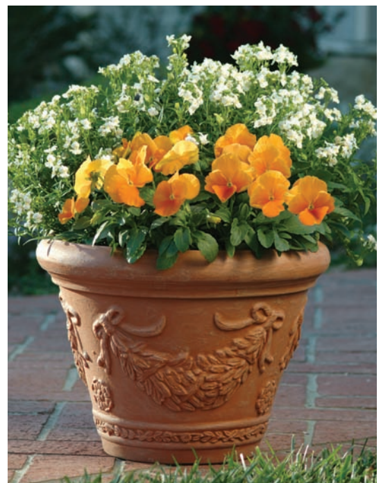
Poetry™ White with Matrix® Orange Pansy