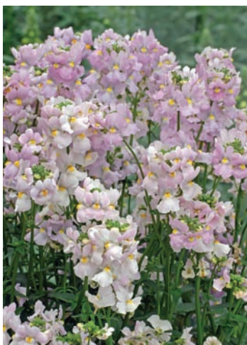
Poetry™ Lavender Pink