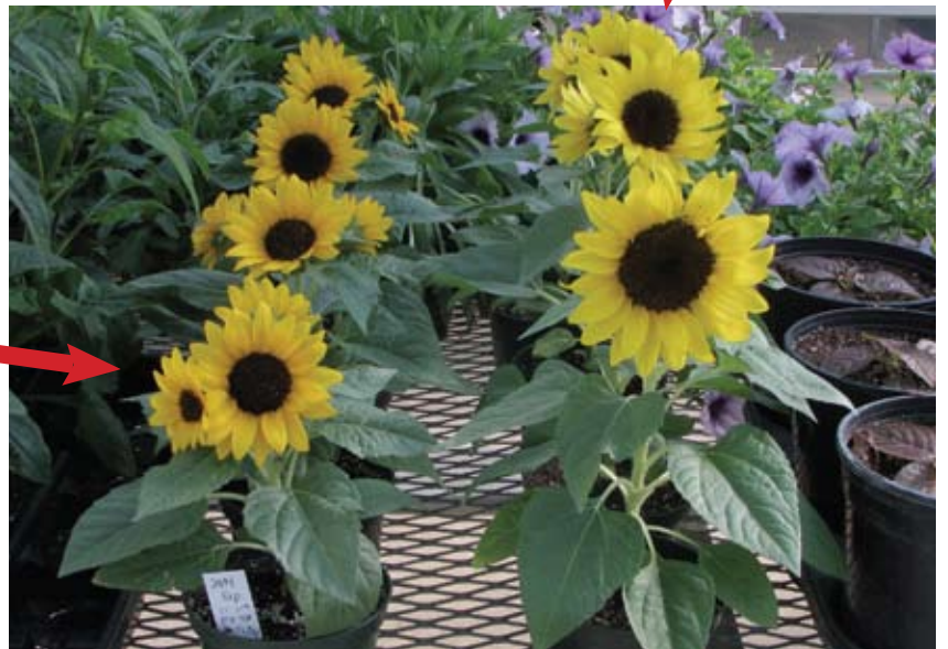
Miss Sunshine Helianthus

Miss Sunshine Helianthus flowers uniformly about 7 to 10 days earlier than Ballad. The plant is about 10 to 25% shorter and the flower size is about 25% smaller than Ballad. Miss Sunshine displays warm golden flowers, and produces secondary blooms more quickly. For larger flowers and bright yellow color, Ballad excels.