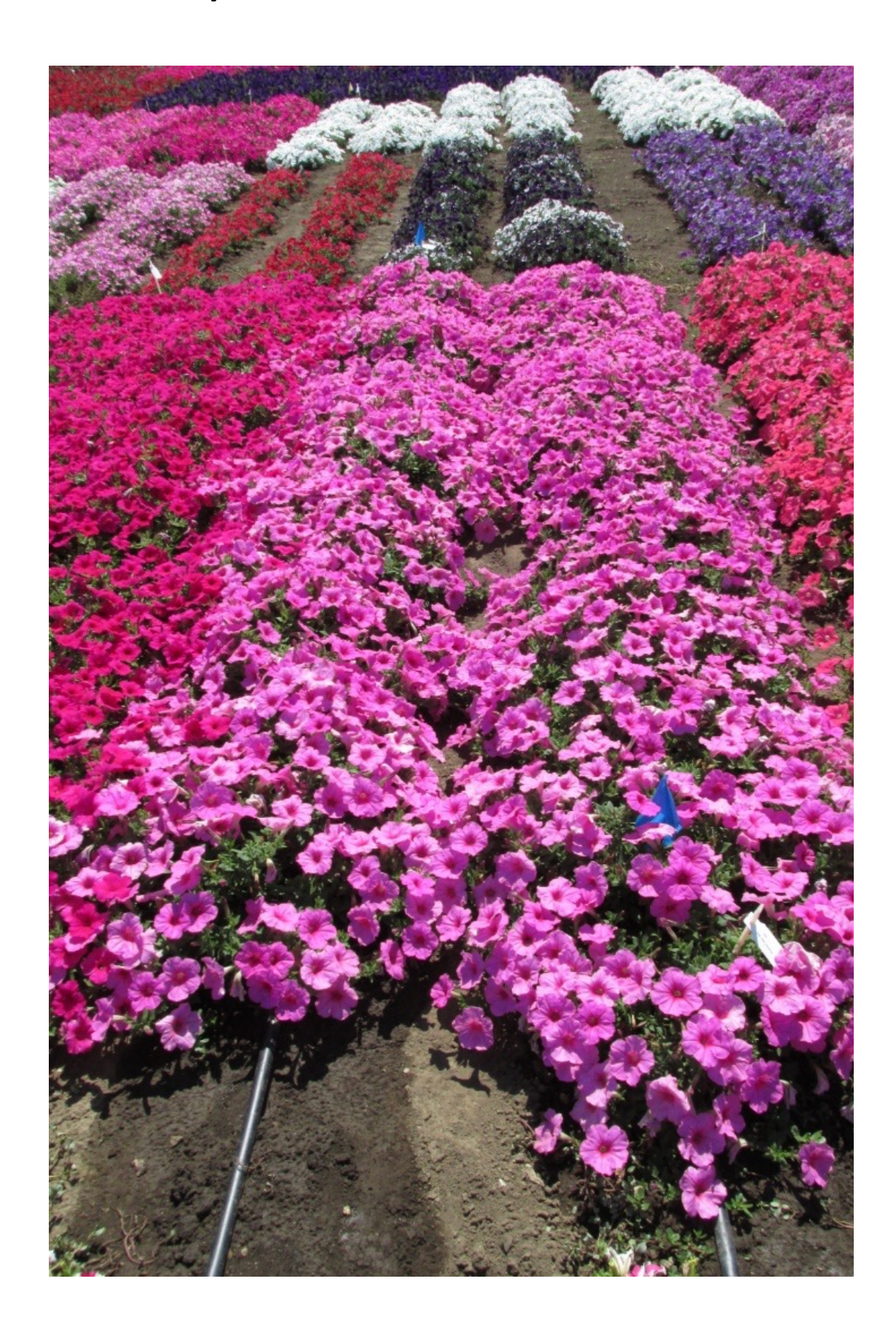
In-ground trials Elburn, Illinois, USA Week 34, 2020