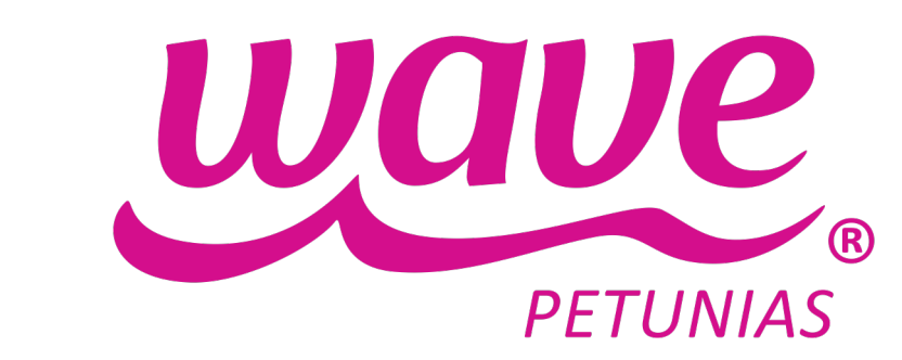
Elburn, Illinois, USA Week 15, 2020