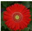
Red with Light Eye