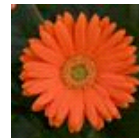
Orange with Light Eye