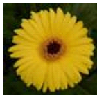
Yellow with Dark Eye