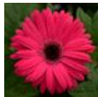
Bright Rose with Dark Eye