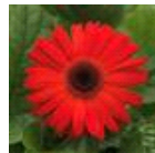
Orange with Dark Eye Improved