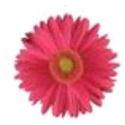
Rose with Light Eye