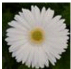
White with Light Eye